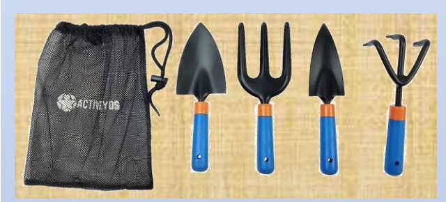
Active Kyds Toy Garden Tools Set, January 2017

Identify whether products in your home have been recalled by checking the Consumer Product Safety Commission's website at <a href="https://www.cpsc.gov/recalls">www.cpsc.gov/recalls</a> and search "lead" for a list of recalled toys.